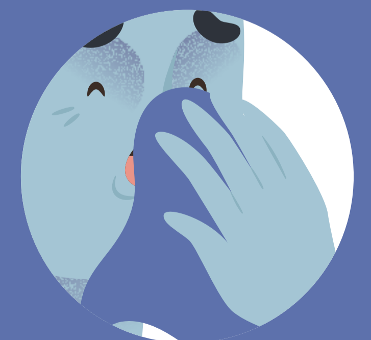
ALWAYS COVER YOUR COUGH OR SNEEZE WITH FABRIC, NEVER USE HANDS!