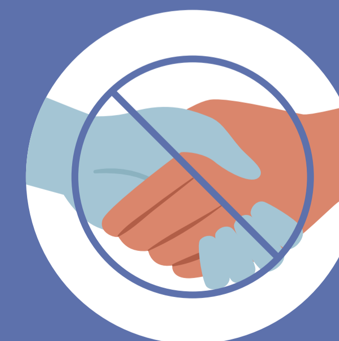
AVOID CONTACT WITH SICK PEOPLE