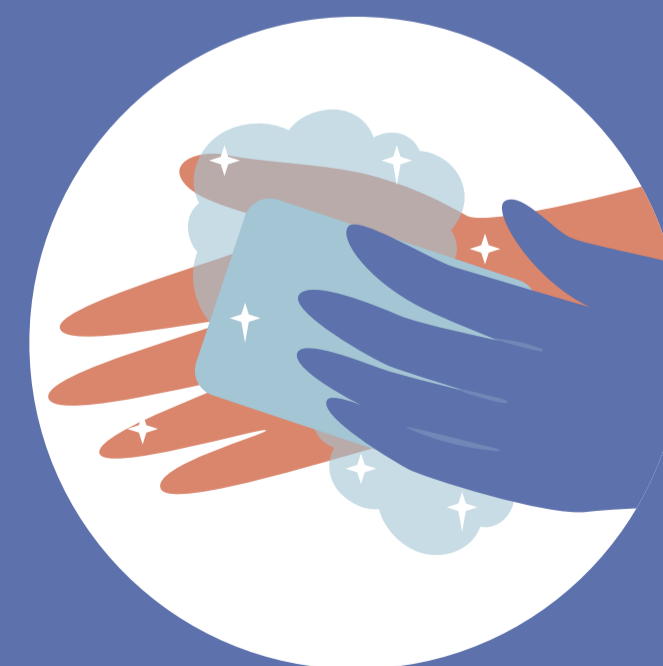
WASH YOUR HANDS OFTEN