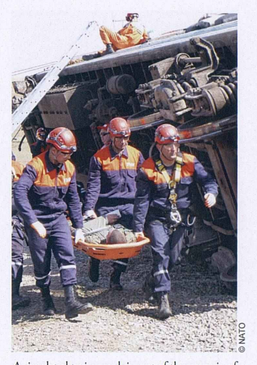
A simulated train wreck is part of the scenario of a major consequence-management field exercise involving participants from Allied and partner countries, organised in Georgia in September 2012.

The SPS Programme also seeks to strengthen the scientific and academic communities in the South Caucasus countries. Georgia participated in the Virtual Silk Highway project, which has helped improve