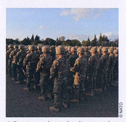
A Georgian peacekeeping battalion on parade in September 2012, shortly before its departure for Afghanistan.