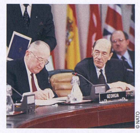
Then Georgian Foreign Minister Alexander Chikvaidze signs the Partnership for Peace Framework Document on 23 March 1994. This paved the way for practical bilateral cooperation between NATO and Georgia, as well as setting out key partnership values and commitments.

The purpose of these commitments and of the EAPC and the PfP programme as a whole is to build confidence and transparency, diminish threats to peace, and build stronger security relationships with the Allies and with other Euro-Atlantic partners.