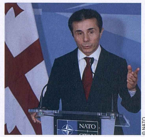
Newly elected Georgian Prime Minister Bidzina Ivanishvili addresses the press during a visit to NATO Headquarters in November 2012, emphasising his government's commitment to achieve the goal to become a full-fledged member of NATO.

A decision was taken in August 2010 to enhance NATO-Georgia relations through more effective military cooperation. The first Military Committee with Georgia Work Plan was developed and implemented in 2011. It details jointly agreed areas of cooperation and objectives, and defines priorities for the allocation of resources. A comprehensive set of activities aims to foster interoperability and to help sustain Georgia's contributions to NATO-led operations as well as to contribute