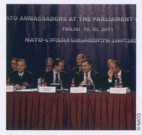
The NATO Secretary General and NATO Ambassadors meet the Chairman and members of the Georgian Parliament, during the visit of the North Atlantic Council to Georgia in November 2011.

One key public diplomacy objective for both the Georgian government and NATO is to inform, educate and manage the expectations of the population about NATO membership, including rights and obligations. Georgia is on the right track and has made significant progress on a wide-ranging reform package. It needs to continue on this path, adopting and implementing further necessary reforms, to realise its membership aspirations.