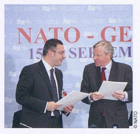
The inaugural meeting of the NATO-Georgia Commission takes place in Tbilisi on 15 September 2008, during a visit to Georgia of the North Atlantic Council, NATO's highest political decision-making body.

Underlining the Allies' continued commitment to the decision taken at the Bucharest Summit a few months earlier, the NATO-Georgia Commission was established in September 2008 to supervise the process aimed at realising Georgia's aspirations to join NATO. The new body was also tasked to oversee NATO's assistance to Georgia following the conflict.