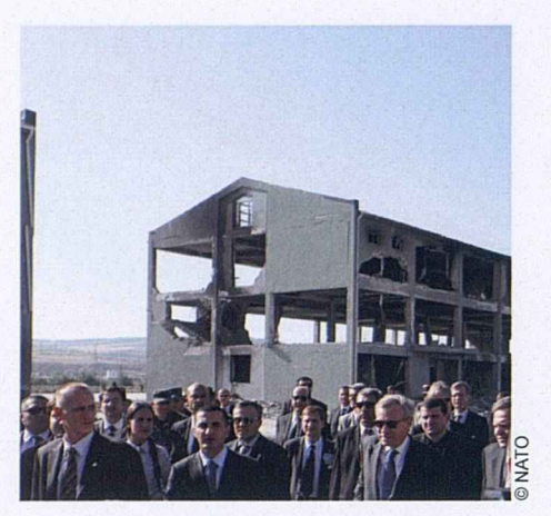
The then NATO Secretary General Jaap de Hoop Scheffer and Allied Ambassadors visit a camp in Gori on 16 September 2008, where some 2200 displaced people had found shelter after the August conflict.