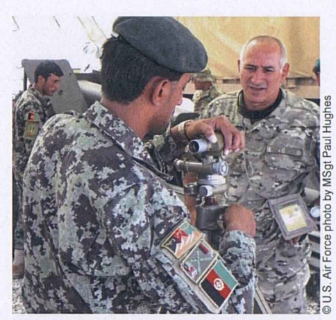
A Georgian soldier observes an Afghan National Army soldier assemble an artillery tool at Camp Hero in Kandahar, Afghanistan, in July 2011.

NATO seeks to ensure that non-NATO troop contributors to its operations are involved in political consultations and decision-making, in operational planning and in command arrangements. As a troop contributor, Georgia regularly participates in high-level meetings between Allies and non-NATO troop contributors, and its personnel have access to the briefing and planning facilities of the International Coordination Centre at Allied Command Operations.