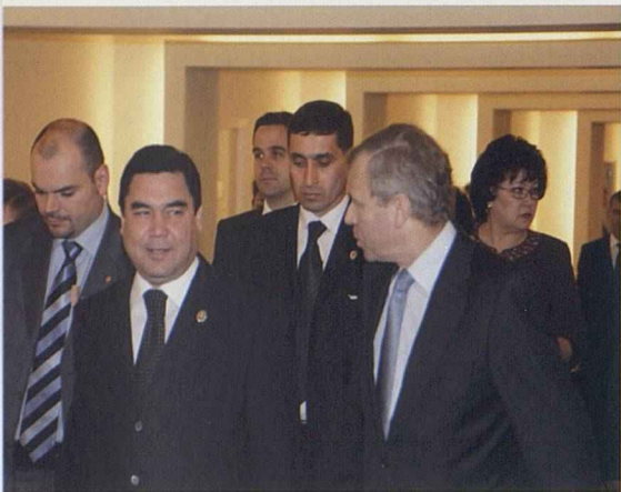
Turkmen President Gurbanguly Berdymuhammedov (left) visited NATO Secretary General Jaap de Hoop Scheffer (right) in Brussels in November 2007 to discuss cooperation and regional security issues. The leaders and top officials of Partner countries regularly visit NATO headquarters for high-level political dialogue.

Kyrgyzstan is showing increased interest in further developing its partnership activities and recently agreed to participate in the PfP Planning and Review Process (PARP) in 2007.