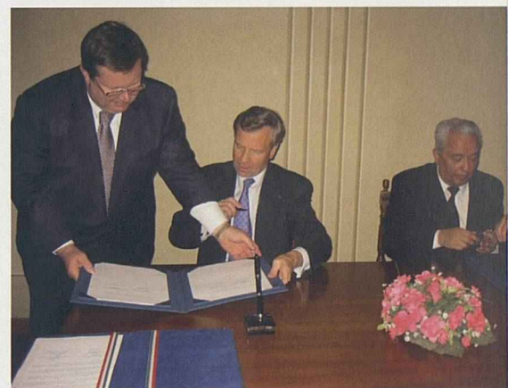
Tajikistan signed a transit agreement with NATO in 2004 in support of the NATO-led operation in Afghanistan.

Kazakhstan has also expressed an interest in supporting reconstruction in Afghanistan, possibly through one of ISAF's Provincial Reconstruction Teams (these are international teams, combining both civilian and military personnel, working in Afghanistan's provinces to provide security for aid workers and help reconstruction work). Kazakhstan recently adopted its first bilateral assistance package for Afghanistan totalling US$3 million, which provides for investment, agricultural aid, and the construction of schools, hospitals and railways. Specialists from Uzbekistan have assisted with a number of infrastructure projects in Afghanistan, including the rebuilding of ten bridges connecting the northern part of