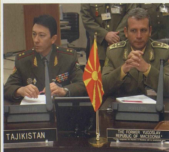
The Tajik Chief of Defence Staff (left) attends a meeting in November 2006 with counterparts from NATO and Partner countries to discuss military-related issues of partnership and cooperation.