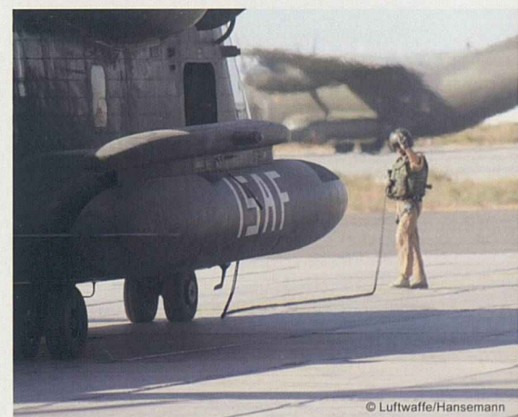
German helicopters stationed in Termez, Uzbekistan, are used for transportation of soldiers and material for the International Security Assistance Force (ISAF) in Afghanistan.