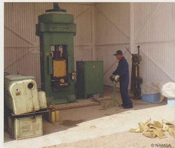
Thanks to a Partnership for Peace Trust Fund project, large stocks of small arms and light weapons will be destroyed in Kazakhstan using available press equipment, seen here crushing 100mm ammunition cartridges.

Another priority for the Alliance is to support Partner countries through the NATO/PfP Trust Fund mechanism with demilitarization projects. These are aimed at assisting Partners with the safe destruction of stockpiles of surplus or obsolete landmines, munitions, and small arms and light weapons, as well as supporting their efforts to manage the consequences of defence reform. Funded by voluntary contributions from individual Allies and Partner countries, these projects typically involve close cooperation with other relevant organizations. In Kazakhstan, the implementation of a project to destroy 27 000 small arms and light weapons as well as 300 man-portable air defence systems is due to start in 2008. A project in Tajikistan, completed in March 2004, supported the safe destruction of the remaining stockpile of over 1200 anti-personnel landmines. This enabled Tajikistan to meet its obligations under the Ottawa Convention on the prohibition of the use, stockpiling, production and transfer of anti-personnel mines and their destruction.