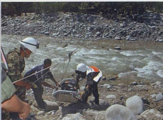
A Kyrgyz rescue team lifts "survivors" of a flood across the river during a disaster-response exercise in Uzbekistan, April 2003.