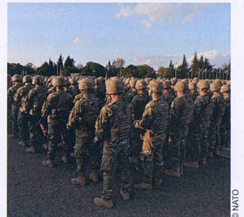
A Georgian peacekeeping battalion on parade in September 2012, shortly before its departure for Afghanistan.