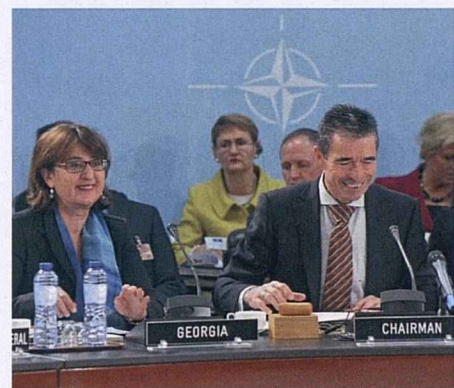
Georgian Foreign Minister Maia Panjikidze (right) sits next to NATO Secretary General Anders Fogh Rasmussen at a meeting of the NATO-Georgia Commission at NATO Headquarters on 5 December 2012. The Allies encouraged all parties in Georgia to keep up the momentum of the recent elections and to consolidate democratic progress. They also thanked Georgia for its substantial contribution to NATO’s mission in Afghanistan.

As an alliance based on democratic values, NATO has high expectations of prospective new members and urges Georgia to continue to pursue wide-ranging reforms to achieve its goal of Euro-Atlantic integration. The Allies strongly encourage the Georgian government’s continued implementation of all necessary reforms, particularly democratic, electoral, media and judicial reforms, as well as defence and security sector reforms. Advice and active support for the country’s reform