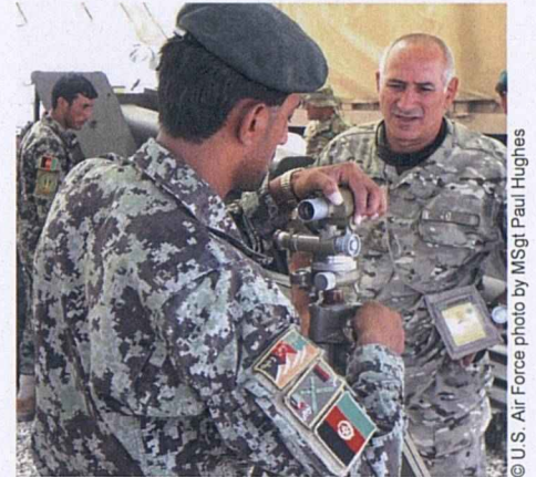
A Georgian soldier observes an Afghan National Army soldier assemble an artillery tool at Camp Hero in Kandahar, Afghanistan, in July 2011.

NATO seeks to ensure that non-NATO troop contributors to its operations are involved in political consultations and decision-making, in operational planning and in command arrangements. As a troop contributor, Georgia regularly participates in high-level meetings between Allies and non-NATO troop contributors, and its personnel have access to the briefing and planning facilities of the International Coordination Centre at Allied Command Operations.