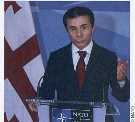
Newly elected Georgian Prime Minister Bidzina Ivanishvili addresses the press during a visit to NATO Headquarters in November 2012, emphasising his government's commitment to achieve the goal to become a full-fledged member of NATO.

A decision was taken in August 2010 to enhance NATO-Georgia relations through more effective military cooperation. The first Military Committee with Georgia Work Plan was developed and implemented in 2011. It details jointly agreed areas of cooperation and objectives, and defines priorities for the allocation of resources. A comprehensive set of activities aims to foster interoperability and to help sustain Georgia's contributions to NATO-led operations as well as to contribute