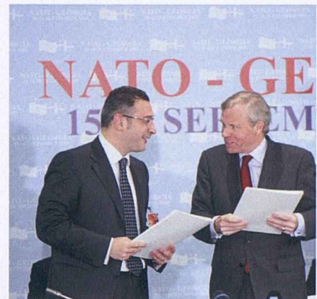
The inaugural meeting of the NATO-Georgia Commission takes place in Tbilisi on 15 September 2008, during a visit to Georgia of the North Atlantic Council, NATO's highest political decision-making body.

Underlining the Allies' continued commitment to the decision taken at the Bucharest Summit a few months earlier, the NATO-Georgia Commission was established in September 2008 to supervise the process aimed at realising Georgia's aspirations to join NATO. The new body was also tasked to oversee NATO's assistance to Georgia following the conflict.