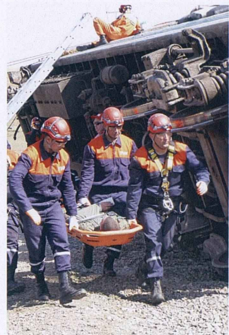
A simulated train wreck is part of the scenario of a major consequence-management field exercise involving participants from Allied and partner countries, organised in Georgia in September 2012.

The SPS Programme also seeks to strengthen the scientific and academic communities in the South Caucasus countries. Georgia participated in the Virtual Silk Highway project, which has helped improve