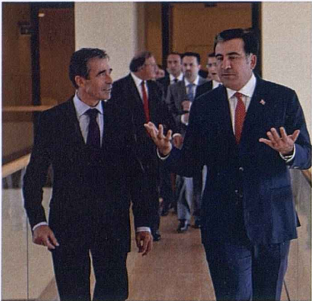
NATO Secretary General Anders Fogh Rasmussen (left) talks to Georgian President Mikheil Saakashvili on the way to their meeting at the Presidential Palace in Tbilisi on 6 September 2012. During the visit, the Secretary General said that Georgia's reforms are bringing the country closer to NATO.

The Georgian crisis had a significant impact on NATO's relations with Russia – formal meetings of the NATO-Russia Council and practical cooperation in some areas were suspended for over a year.