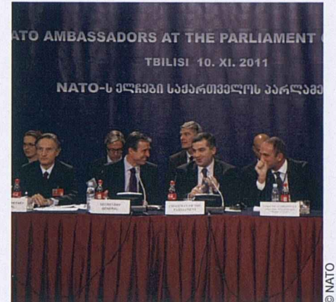
The NATO Secretary General and NATO Ambassadors meet the Chairman and members of the Georgian Parliament, during the visit of the North Atlantic Council to Georgia in November 2011.

One key public diplomacy objective for both the Georgian government and NATO is to inform, educate and manage the expectations of the population about NATO membership, including rights and obligations. Georgia is on the right track and has made significant progress on a wide-ranging reform package. It needs to continue on this path, adopting and implementing further necessary reforms, to realise its membership aspirations.