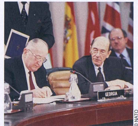
Then Georgian Foreign Minister Alexander Chikvaidze signs the Partnership for Peace Framework Document on 23 March 1994. This paved the way for practical bilateral cooperation between NATO and Georgia, as well as setting out key partnership values and commitments.

The purpose of these commitments and of the EAPC and the PfP programme as a whole is to build confidence and transparency, diminish threats to peace, and build stronger security relationships with the Allies and with other Euro-Atlantic partners.